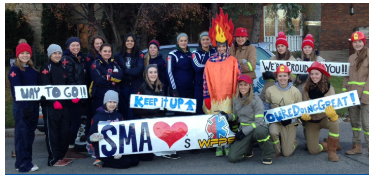
SMA Athletic's Council running water stations at WFPS marathon