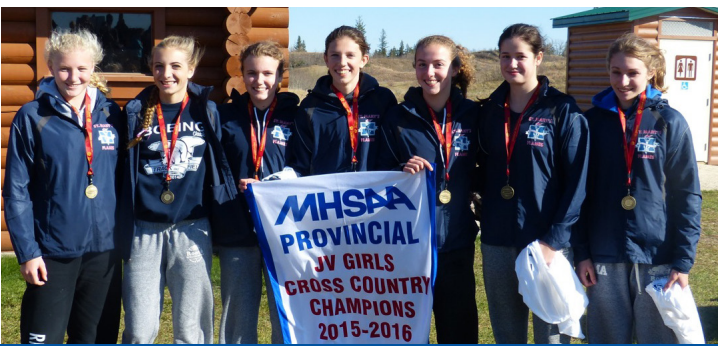
Junior Varsity Cross Country: Manitoba High School Athletic Association Champions