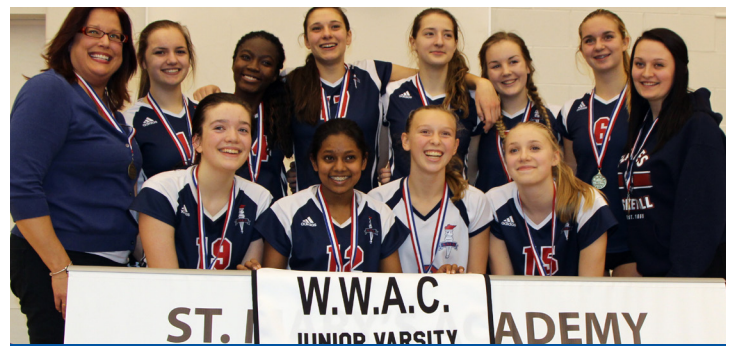
Junior Varsity Volleyball Team: West Winnipeg Athletic Conference Champions