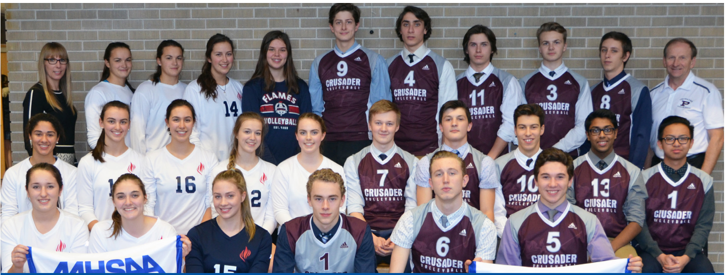
SMA and SPHS Varsity Volleyball Teams: Manitoba High School Athletic Association Provincial Champions