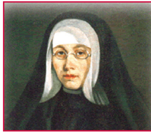
Blessed Mother Marie Rose Durocher

On behalf of the Board, thank you for your support during this exciting process and Merry Christmas.